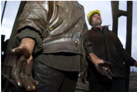
Where are we heading this time?

Furthermore, governments could do various things to dampen the impending rise in prices, argues McKinsey, a consultancy which is also predicting an oil-supply crunch in the next few years. One simple measure would be to allow trucks to pull longer trailers, thereby increasing fuel efficiency. Rich countries could also increase fuel supplies by removing tariffs on imported ethanol, the company argues. Persuading developing countries to drop fuel subsidies would make a big difference. In the longer run, ever more stringent restrictions on carbon emissions and ever higher efficiency standards for vehicles around the world will presumably help crimp demand for oil.